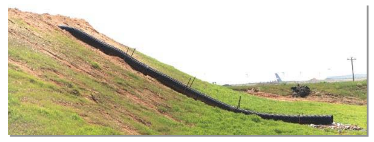
Photograph TSD-1. A temporary slope drain installed to convey runoff down a slope during construction.

A temporary slope drain is a pipe or culvert used to convey water down a slope where there is a high potential for erosion. A drainage channel or swale at the top of the slope typically directs upgradient runoff to the pipe entrance for conveyance down the slope. The pipe outlet must be equipped with outlet protection.